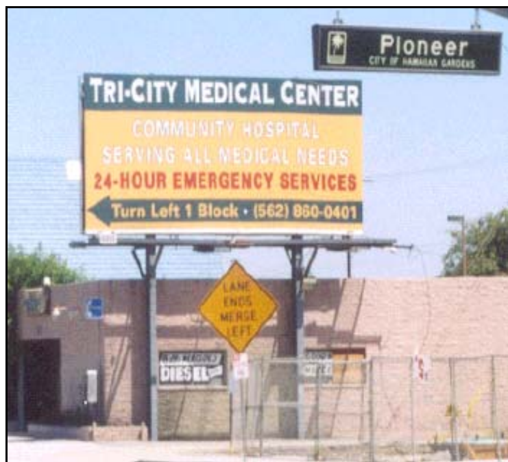
Tri-City Hospital sign greets motorists entering Hawaiian Gardens saying the "community" facility serves all health needs – as long as you're not poor or pregnant.