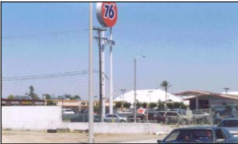
Casino under construction in 2000; bingo, barely visible, is in the strip mall to the left.