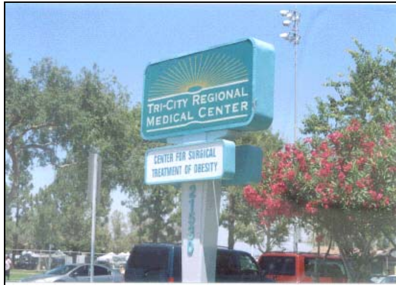
Stomach stapling accounts for a large part of Tri-City Hospital's tiny patient census.

Comparing city budget documents and the foundation's IRS Form 990s, there is a $372,894 discrepancy between what the public safety foundation claimed to have given the city and what the