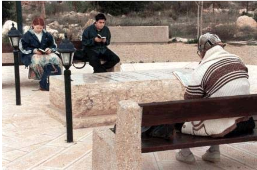
Baruch Goldstein's grave became a shrine (shown) of ultra-nationalist religious settlers but the court ordered it be returned to its previous simple state.