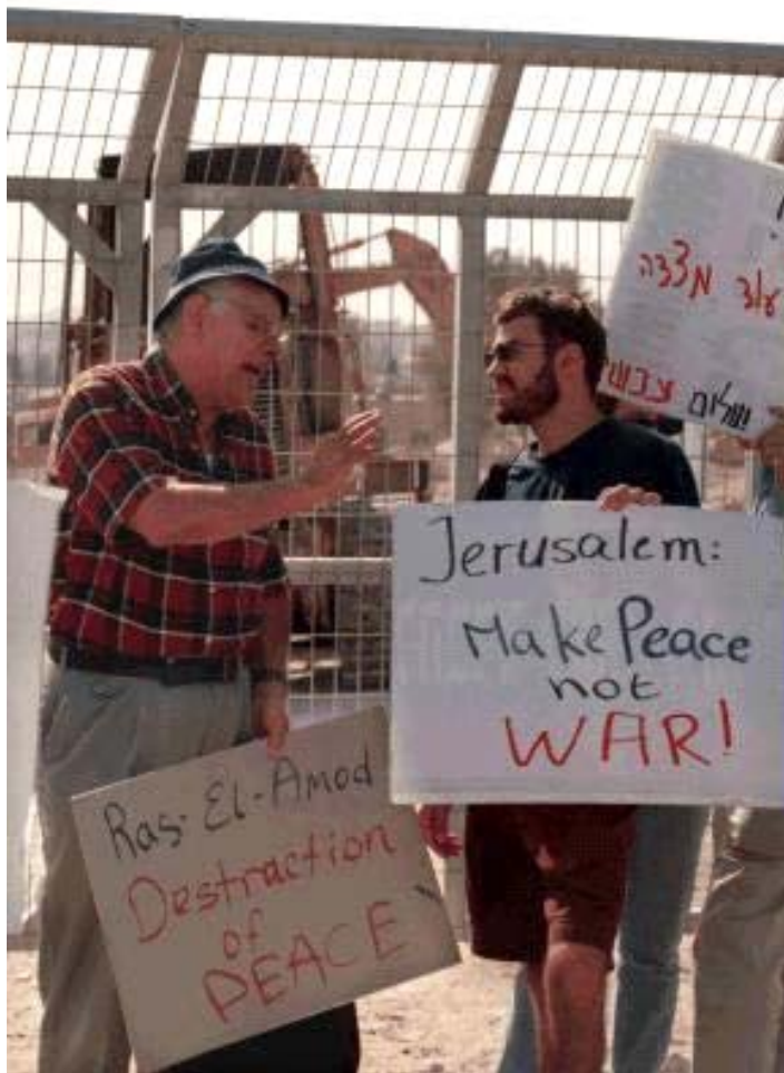
Protestors tell Moskowitz to go home.

involved with, the site was politically sensitive as well as strategic. Close to the Temple Mount, the building looked down on the Arab neighborhood of Silwan, considered the probable location of the ancient City of David.